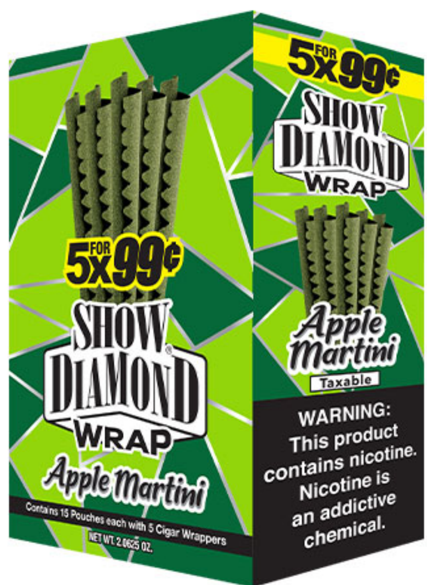
SD5x200 - Show Diamond Wrap 5x.99¢ - Apple Martini