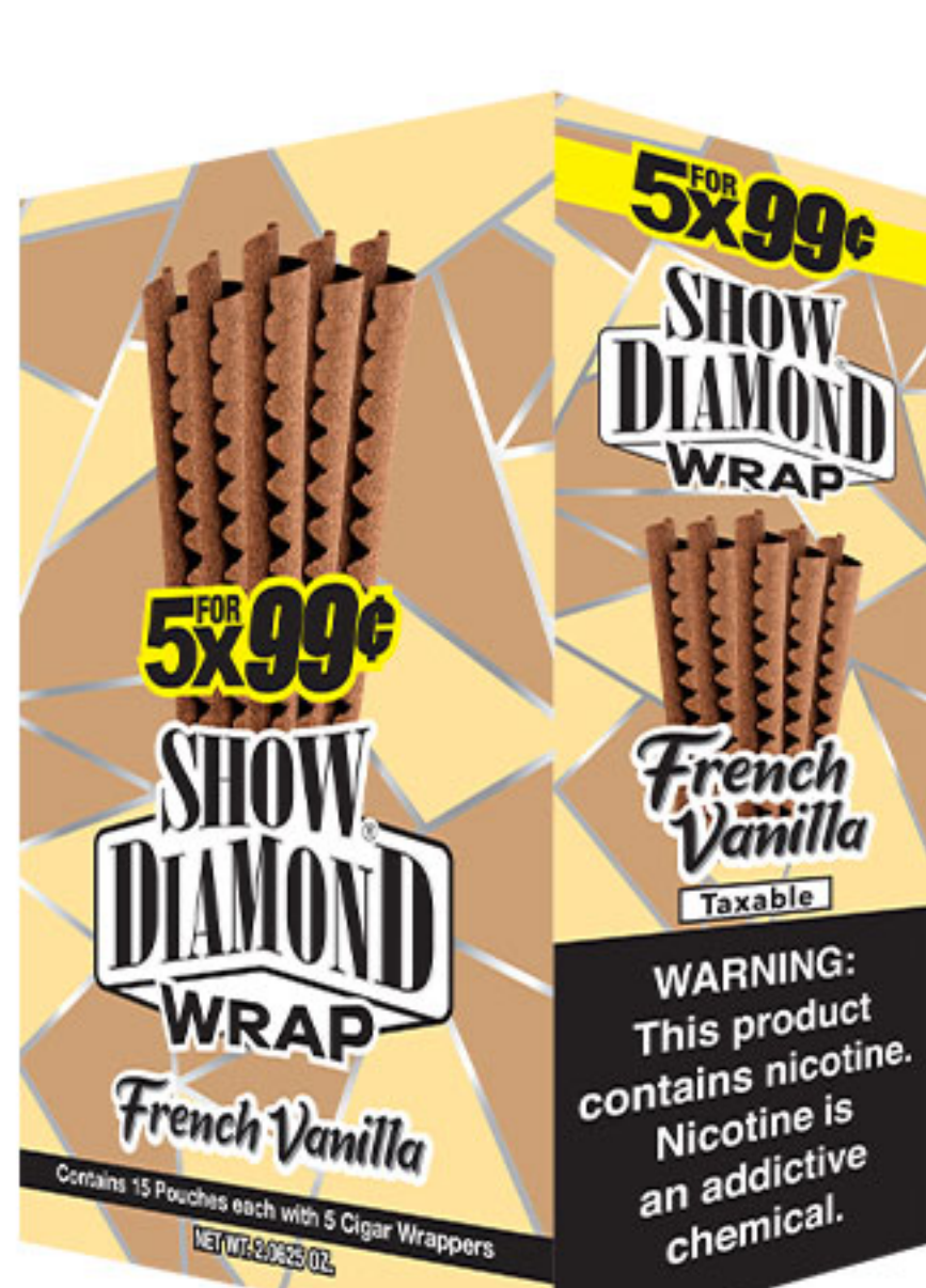
SD5x202 - Show Diamond Wrap 5x.99¢ - French Vanilla