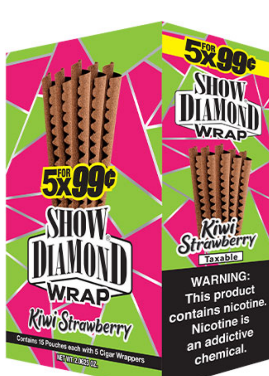
SD5x203 - Show Diamond Wrap 5x.99¢ - Kiwi Strawberry