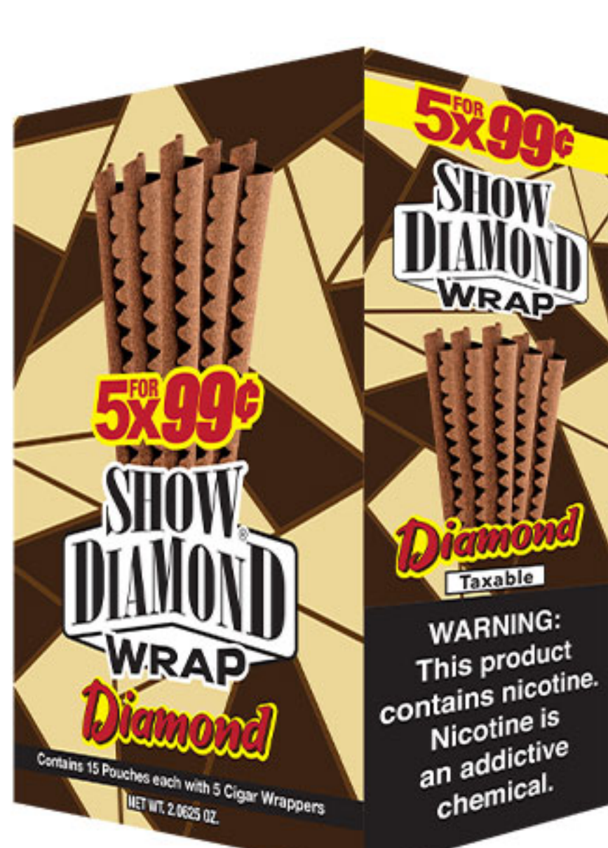
SD5x201 - Show Diamond Wrap 5x.99¢ - Diamond